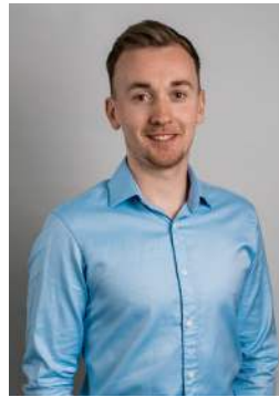
Steven Bohan Event Technology